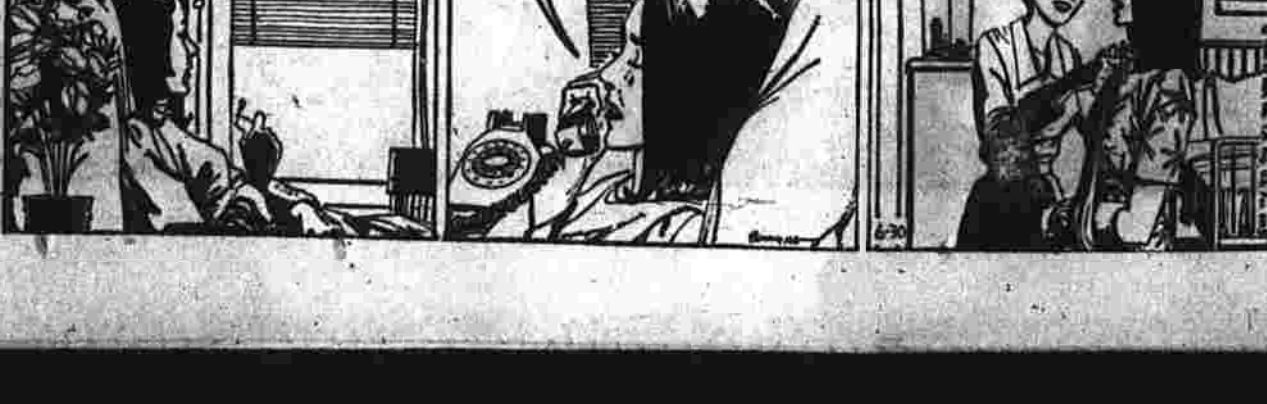
THE STORY OF MARTHA WAYNE